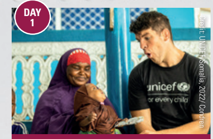
"It was incredible to see the brilliant work UNICEF is doing in Somalia with your help."

Some of the people in this camp have travelled incredible distances — some up to 100km to be here. UNICEF staff are on the ground and supporting them but they're arriving in desperate need of urgent supplies and care. It's hard to see, especially when you think of the journeys these people have made to get here, but UNICEF is doing incredible work to help them with every requirement that they need at this point.